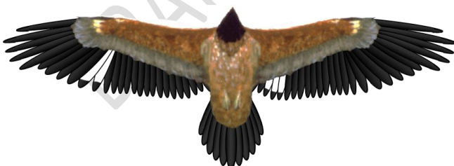
BG 797 „Calfeisen 1“ right wing: 10-11 left wing: 23-25

Born: 22.02.2014 in Goldau, sex male Rings: right silver with code 191 , left gold