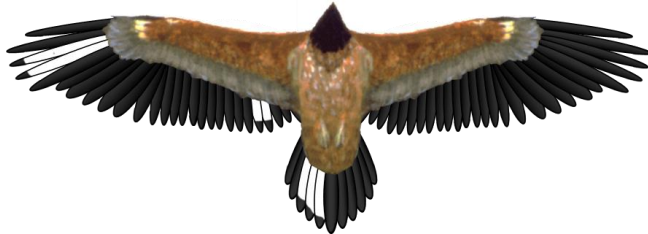
BG 794 „Causses 1“ right wing: 3-4/23-24 tail right: 3-5

Born 16.02.2014 in Ostrava, sex male Rings: right silver with code 151 , left pink