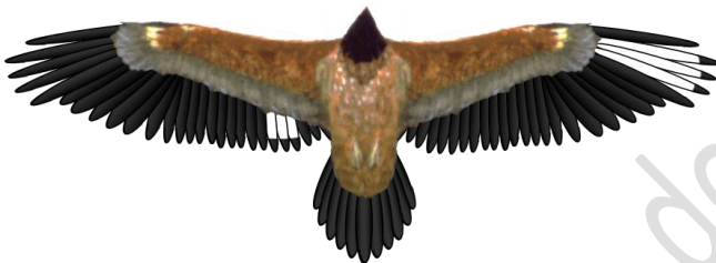
BG 790 „Tauern 1“ left wing: 2-4 right wing: 22-24

Born: 11.02.2014 in Liberec, sex male Rings: right silver with code 171 , left violet