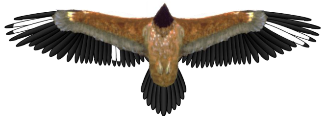
BG 802 „Calfeisen 2“ right wing: 4-5 left wing: 2-3/20-21

Born: 22.02.2014 in Goldau, sex male Rings: right silver with code 191 , left gold