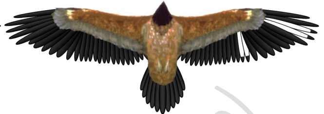
BG 795 „Causses 2“ left wing: 3-4/12-13

Born 16.02.2014 in Ostrava, sex male Rings: right silver with code 151 , left pink